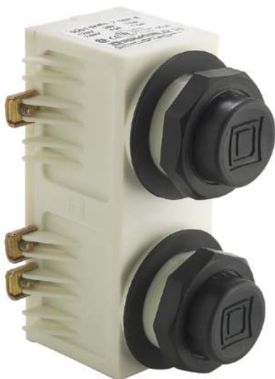
Type SKRU push button assembly

Remarks: The recalled units are certified to Canadian Standards by CSA. For more information about the CSA product certification process please visit: www.csa-international.org