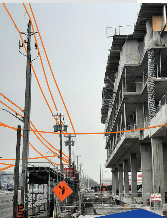
Figure 1: Ontario Building Code Clearance Requirements