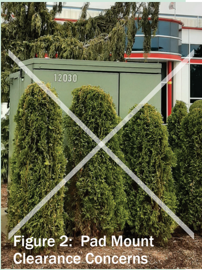
Figure 2: Pad Mount Clearance Concerns