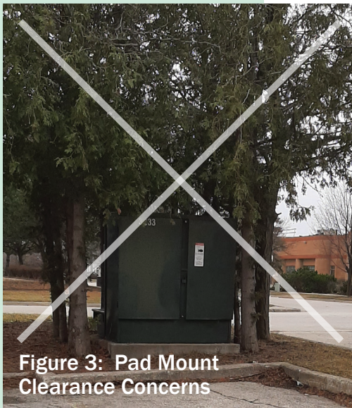
Figure 3: Pad Mount Clearance Concerns