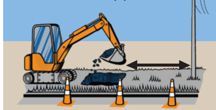
Figure 5: Contractor Excavation Near Electrical Equipment

See ESA's "Guideline for Excavating in the Proximity of UG Distribution Lines" www.esasafe.com and contact Halton Hills Hydro for guidance before excavation in the proximity of electrical infrastructure.